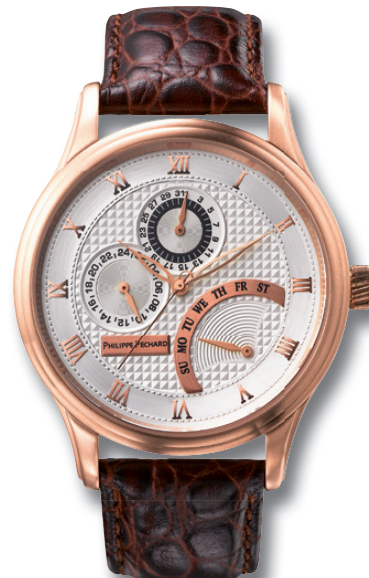
RU59-RG rose gold plating