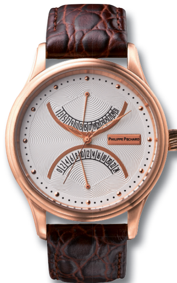
RU59M-RG rose gold plating