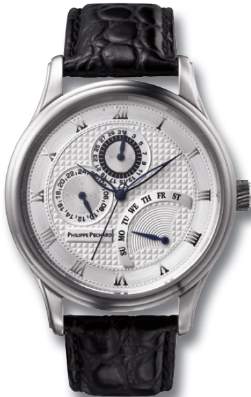
RU59-SL silver plating