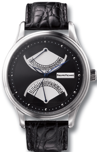
RU59M-BK silver plating